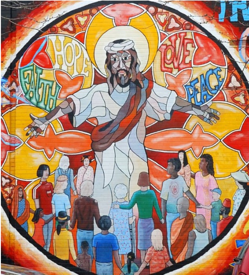
Jesus Mural of Faith, Hope, Love, and Peace, from Art in the Christian Tradition, a project of the Vanderbilt Divinity Library, Nashville, TN.

The Last Sunday after the Epiphany Holy Eucharist, Rite II February 23, 2020 • 10 am