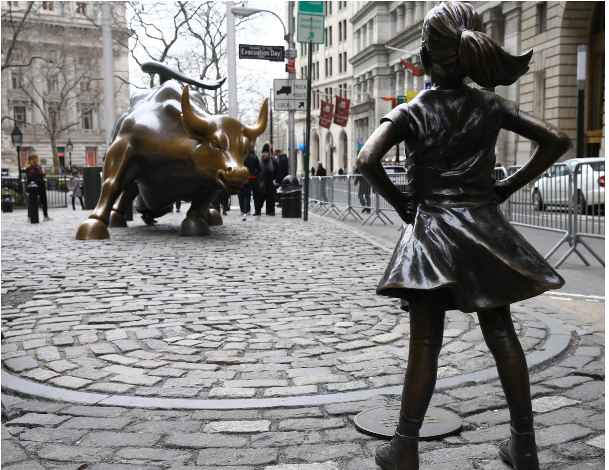
Kristen Visbal. Fearless Girl . Arturo Di Modica. Charging Bull .

The Fourteenth Sunday after Pentecost Holy Eucharist, Rite II September 15, 2019 • 10 am